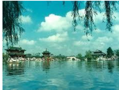
Part of the Humid Subtropical in China