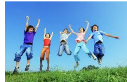
Kids Playing Outside

There are a lot of things to do outside in this climate because it is hot out a lot. You could go play a lot of sports, go on a walk or run, play with your pets, or play with your friends. If you do play outside all day make sure you drink plenty of water so you don't get dehydrated.