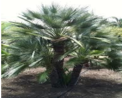
Type of tree in the Humid Subtropical

The Humid Subtropical is made up of mostly evergreen trees, bushes and shrubs. The trees here are mostly very delicate unlike pines and spruce. The reason most trees here are evergreens is so they can endure the long months of warmth and regular rain. These plants have adapted to the regular climate conditions. A few type of broad leave evergreens found here are palm trees and ferns. This climate is usually easy to farm in because the growing season is usually 8 months long!