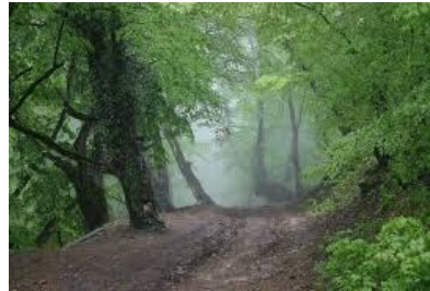
Forest In this Climate